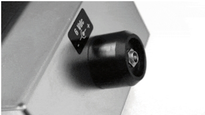
Battery with INSTAPLUG innovative quick coupling wireless system.