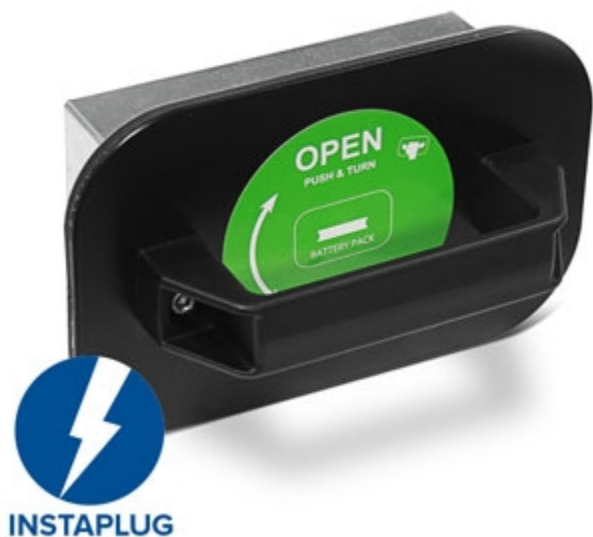
Removable rechargeable battery with INSTAPLUG quick connector.